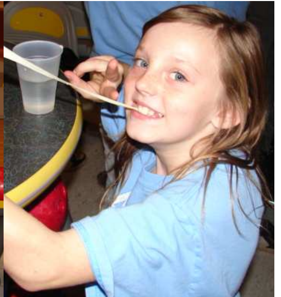
Schofield 5th Grade went to Dale's Weston Lanes for DARE Bowling